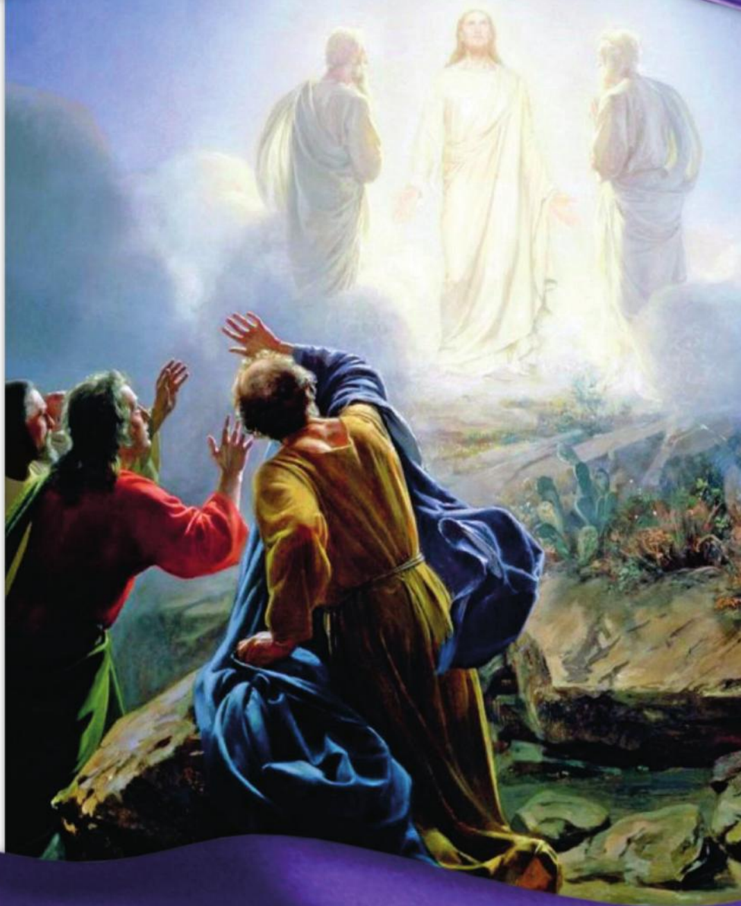
Transfiguration of Jesus by Carl Bloch, 1872