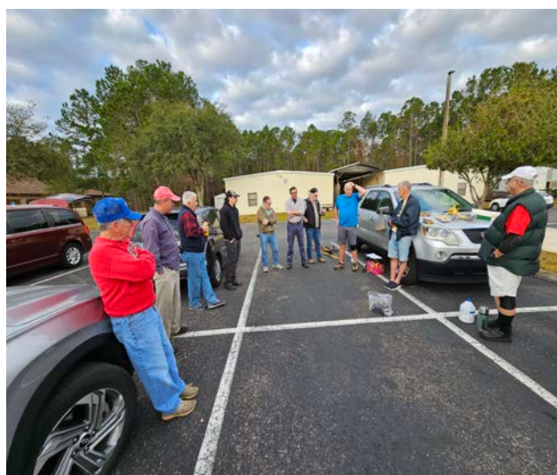
Day of Service Crew