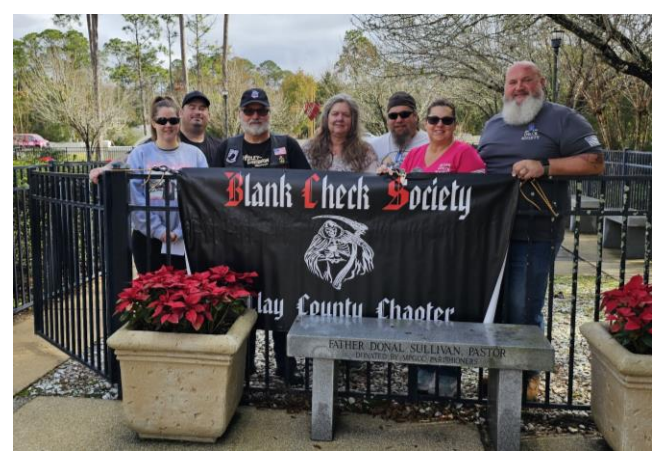
Blank Check Society place flags on the headstones of veterans and first responders.